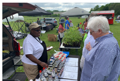
Buy or sell fresh produce at the North End Farmers Market.

Workforce Development: Get a job or recruit your next super star.