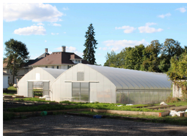
Join a cooperative of local growers growing food on residential lots.