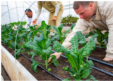
Returning citizens learn skills growing food and second chances at the RiCi Farm.