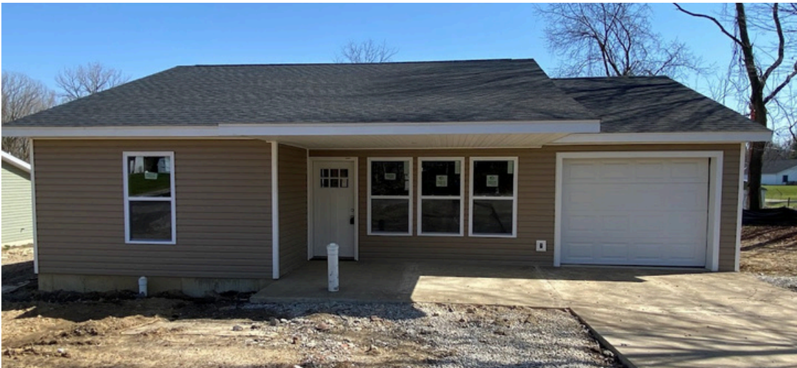
Develop affordable and mixed-income housing. An example of new housing constructed on the North End.

As mentioned above, from the very beginning of NECIC, North End residents expressed concerns about the condition of homes on the North End. In 2010, residents said they wanted to see vacant and blighted housing removed from their neighborhoods. NECIC recommended targeted demolitions as a good first step. In addition to the housing assessments and 844 subsequent demolitions described above under “Land Use”, NECIC partnered with the Richland County Land Bank to acquire a portfolio of vacant lots, not just to prevent land speculation, but to prepare for future construction of affordable housing.