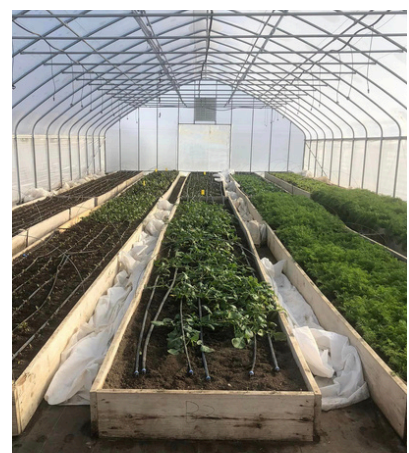
Food and jobs are grown at the NECIC Urban Farm.