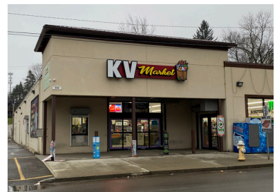
Support investment in reopening a neighborhood grocery store, hiring local people, and selling produce grown around the corner.